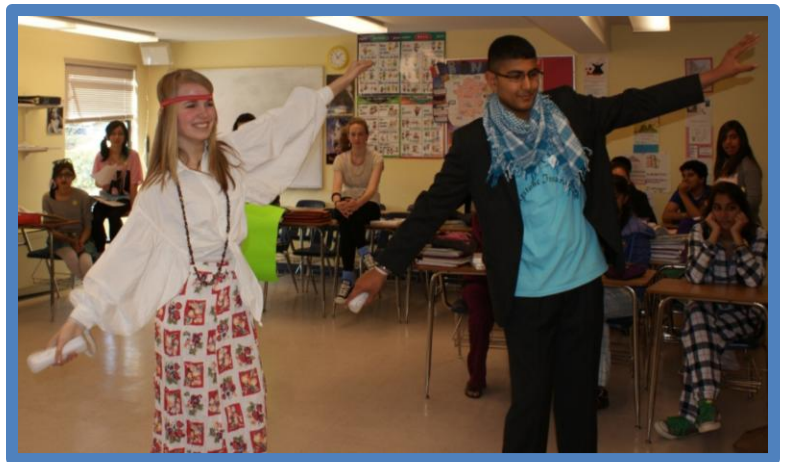
"French in the 60's 70's & 80's!"