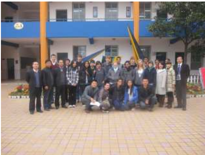
Yuelu Academy in Changsha