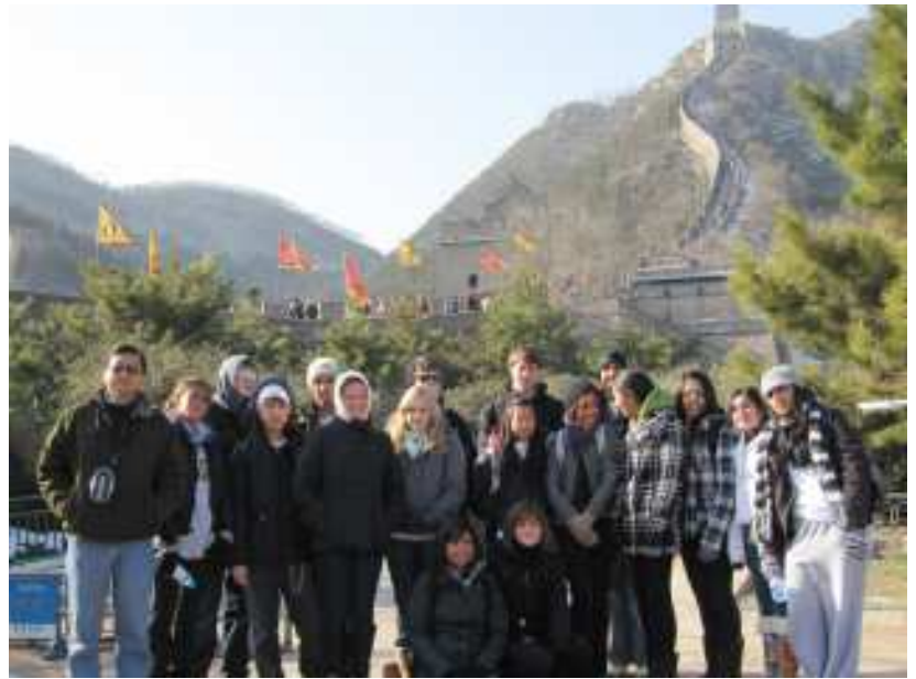
The Great Wall in glorious sunshine!

In the above picture, Southpointe students pose for the art class, at the High School attached to the Hunan Normal University.