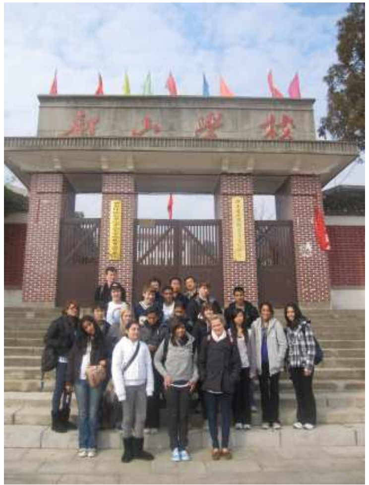
Southpointe at the local school in Shaoshan.