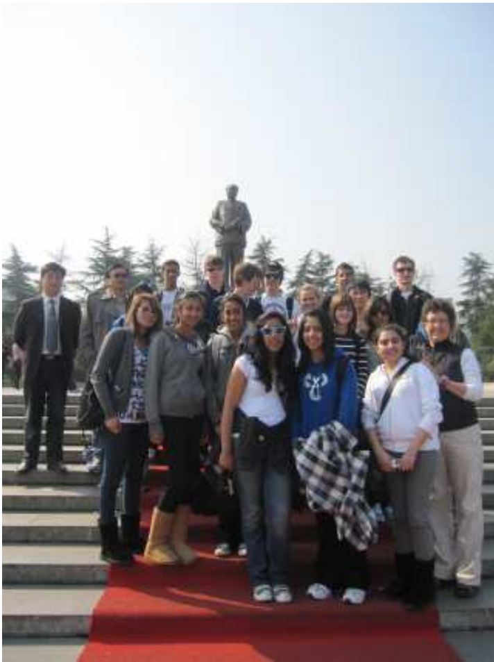
Chairman Mao's impressive statue in the Centre of Shaoshan, his childhood home town.